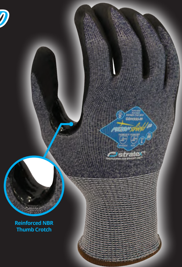
Reinforced NBR Thumb Crotch