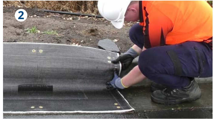
Slightly overbending the aluminium strip angle can help to ensure a tighter gutter fit.