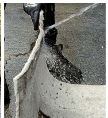
a) Use a brush or broom to sweep away leaves and debris. b) Can also be hosed from behind to remove silt build up.