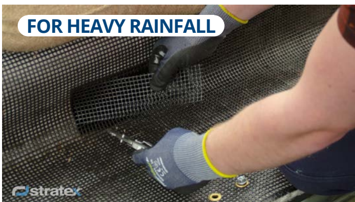
The mesh centre can also be cut out to prevent flooding in heavy rainfall.