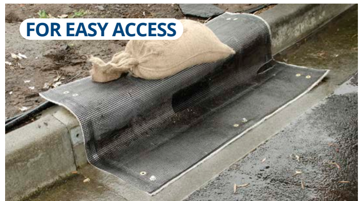
If easy drain access is required, a sandbag can be used to secure the top edge of the GuardDog.